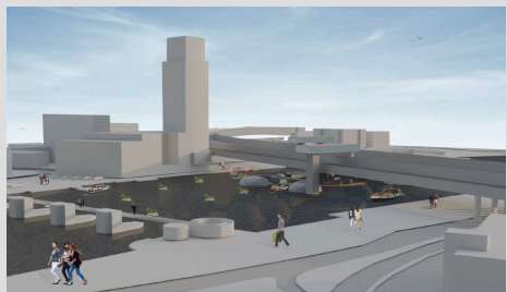
Belfast's floating plaza / Render