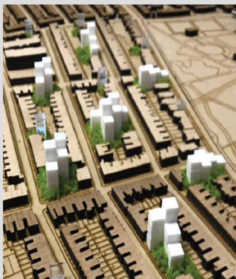
"Archipelagos" Urban Design / Laser cut model