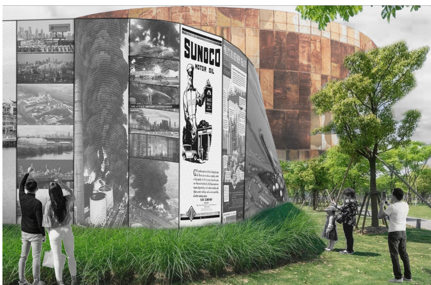
Oil Tank Sensory Park Atmospheric Collage

Address: Eldon Building, Southsea, Portsmouth, PO5 4BG UK Email: phevos.kallitsis@port.ac.uk Telephone Number: +44 (0)23 9284 5452