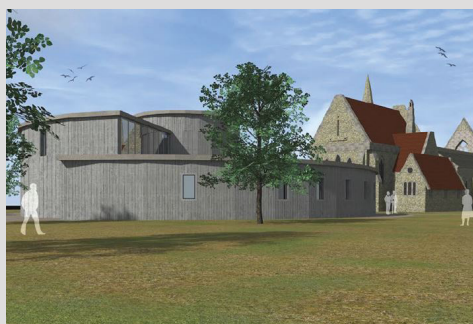
Royal Garrison Church Theatre / Renderings