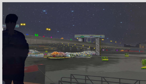
Belfast's floating plaza / Atmospheric Drawing