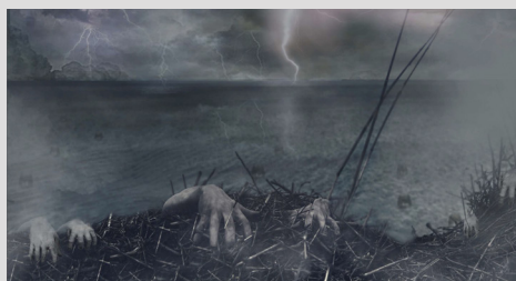
Belfast's under attack / Brief Collage

An ambitious, hard-working individual who is now seeking to expand her skills and expertise as an ETEK Registered Member Architect. Master's in Architecture and trainee experience has driven my passion for detailing, materiality and sensitive design, while enhancing my research and graphic skills.