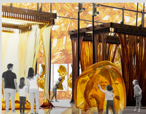
Oil Tank Sensory Park / Abstract collage of the sensory experience of a caramel space